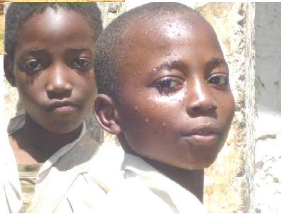
Above and right: Some pupils of the primary school section

Strathmore learnt about the school and immediately began to provide motivational talks to the students. A pledge of scholarships was made for all those who qualified to join university and this greatly motivated the students to aim high.