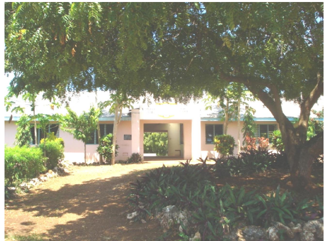
Above: The courtyard of the school